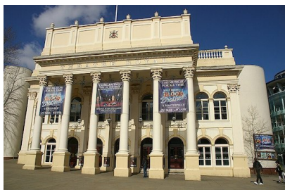
Theatre Royal Nott'm.