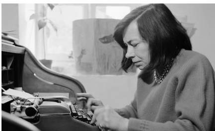
Patricia Highsmith at home in 1977, from The Guardian, 9 Jan 2021.

Employing a compelling, slow burn development of both characters and plot lines, Highsmith crafts a brilliant and shocking portrayal of coercion, blackmail and the descent into unimaginable horror of her two main protagonists.