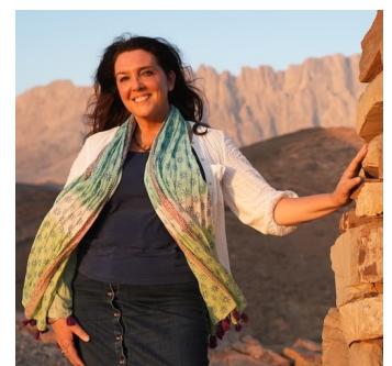
Bettany Hughes in The Guardian, 25 Feb 2023.

Although this is a polished, exhaustively researched academic text, Hughes makes it readily accessible to the general reader, rendering a stimulating, informative and thoroughly enjoyable experience.