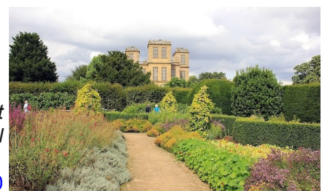
Herb Garden at Hardwick Hall

If you would like to go on the day trip, please email gardening@charnwoodu3a.org.uk and you will be sent a form to complete and return with payment. Closing date for booking is 25th May.