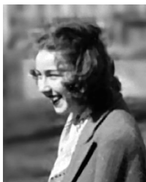
Flannery O'Connor in 1947

*For those interested in looking at Robert McCrum's list, search online for "Guardian 2003 The 100 Greatest Novels".