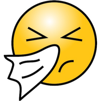
TAKING A HOLIDAY TO CATCH A COLD: HUMAN "GUINEA-PIGS" IN ISOLATION.

It was a camp of many wooden, centrally heated, lino floored, 3 bedroom huts with showers, telephone etc. - quite luxurious after our wartime restrictions.