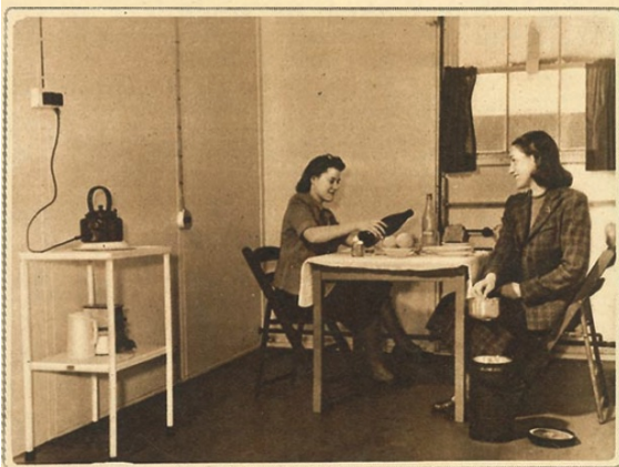
Lunch-time for the human "guinea-pigs": Meals are left outside the flats.

On arrival, volunteers were given a medical and X ray and the following day drops up our nostrils of possible common cold infested virus. During our voluntary incarceration we were visited once a day by medical staff but otherwise left to do whatever we wished, so long as we kept to the 30 feet isolation space between ourselves and other volunteers. Each day three meals were delivered to the door in 3 tier wide vacuum flasks which were left by a masked worker.