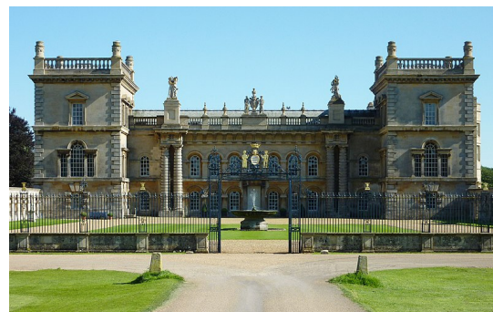
North facade of castle.

Grimsthorpe Castle, built of golden limestone quarried locally, rises majestically above its sweeping parkland. Some of the building dates from Tudor times, but the splendid main frontage was the last masterpiece of Sir John Vanbrugh, architect of Blenheim Palace, Castle Howard, Seaton Delaval Hall etc. The house contains a series of richly decorated and furnished rooms with many fine pictures, and also has one of the largest collections outside the Royal palaces of Royal thrones and furnishings, as the Willoughby family retain the hereditary office of Lord Great Chamberlain.